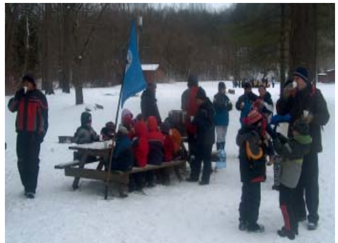
1st Stevensville and 31st Niagara warming up at the cup-of-soup stop.

We hope to see everyone again next year!