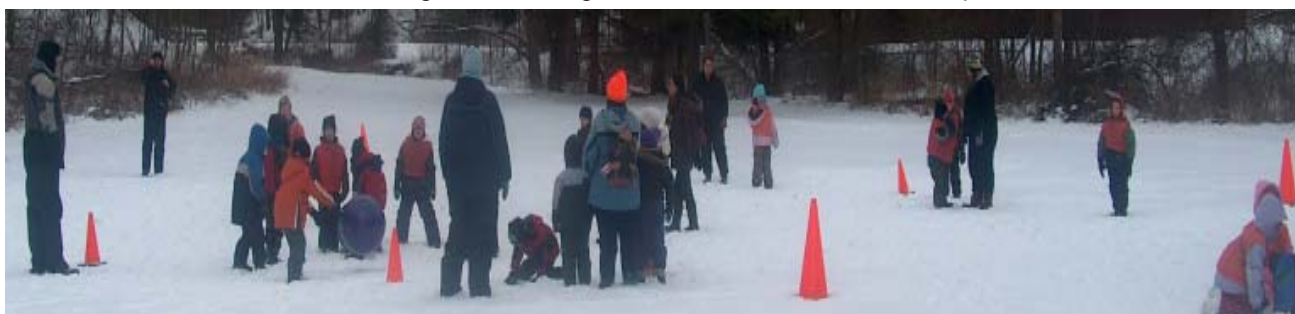
1st and 6th Niagara playing soccer with 2 exercise balls.