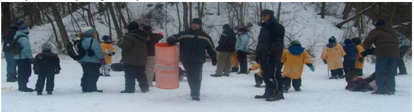
40th and 33rd St. Catharines tubing and sledding on site #2, with a lot of leader power.