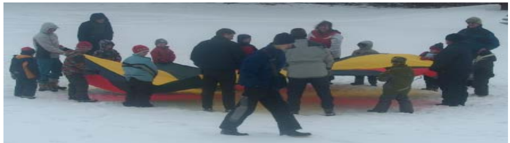
5th Thorold and 6th St. Catharines playing cat and mouse on the parachute.

On Saturday, January 10th, the St. Catharines Area held its annual Beaver Shiver at Camp Wetaskiwin. We had 112 youth and 60 leaders and volunteers enjoying different outdoor activities...in the snow!! Lots of activity and a little hot soup helped keep everyone warm. After participating in the outdoor activities, we all went into the Lodge for lunch and a craft.